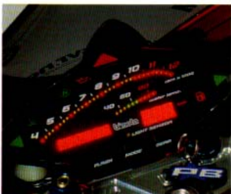
■ Skeggy seafront by night; 50p = 2 PLAYS