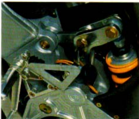
■ Acres of ally, carbon and a quality spring