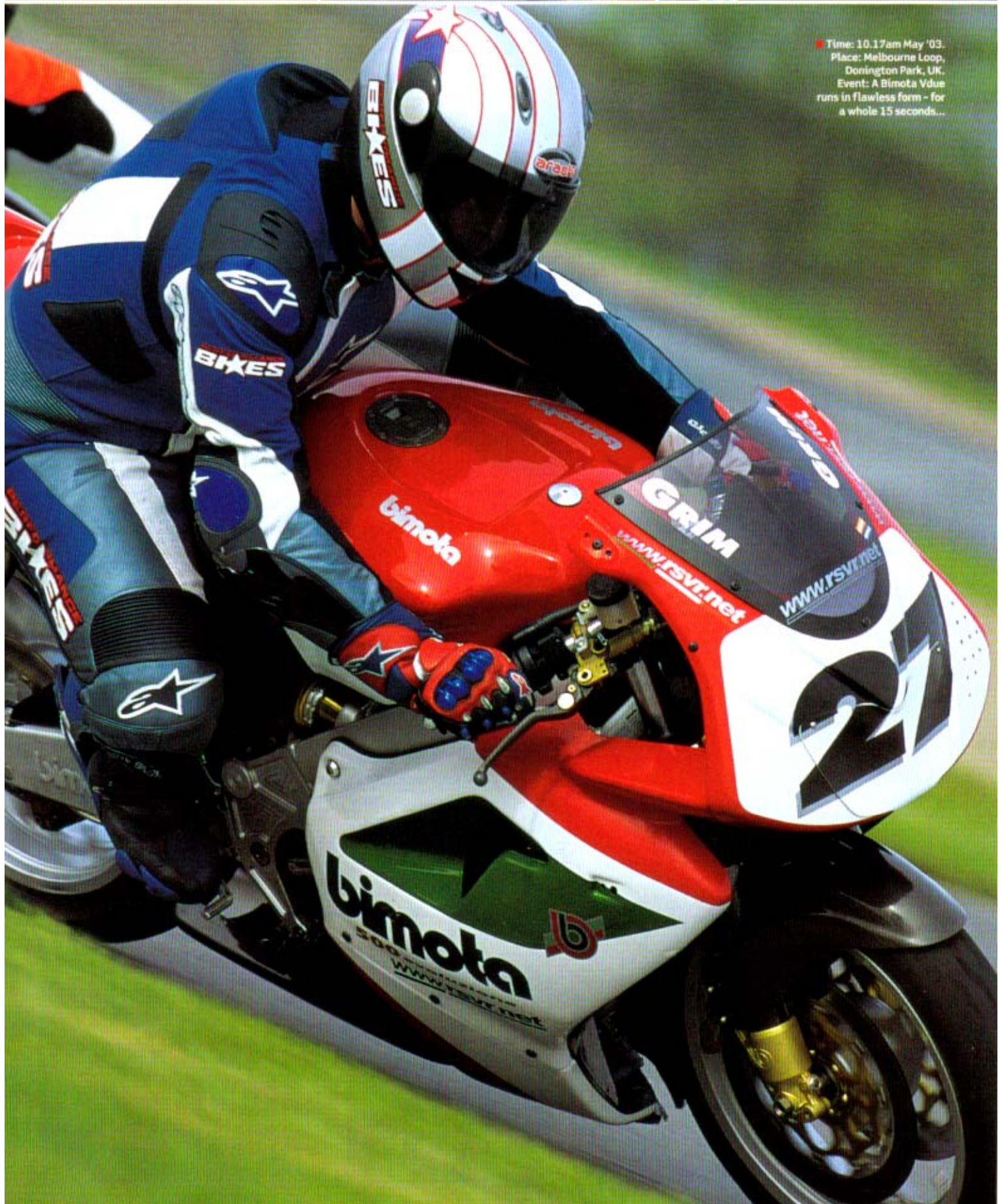
Time: 10.17am May '03. Place: Melbourne Loop, Donington Park, UK. Event: A Bimota Vdue runs in flawless form - for a whole 15 seconds...