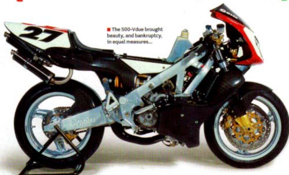
■ The 500-Vdue brought beauty, and bankruptcy, in equal measures...

"A 499cc liquid-cooled two-stroke V-twin knocking out 105bhp"