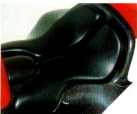
■ Obviously they didn't anticipate the Lomas arse...