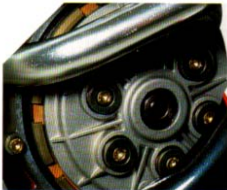
■ No clutch cover on this factory racer

"It only takes two attempts before the thing crackles into life"