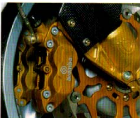
■ Brembo Goldline 4-pot calipers grace 320mm discs