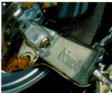
■ No ordinary swingarm - it's a piece of history